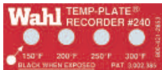
STANDARD Four-Position Base Part No. 240 .75" X 1.75" (19 x 44mm)

Example: 240-150F for a standard size with temperature positions at 150°, 160°, 170°, & 180°F