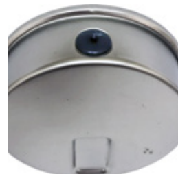
40CB Fill Top