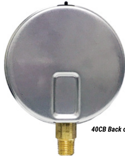
40CB Back of Gauge