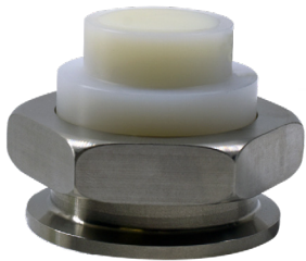
H6 KF-40 Sensor Housing