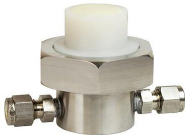
H3 Flow Through Sensor Housing