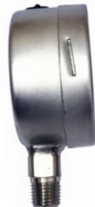
25SS Bayonet Bezel